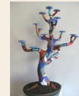
Jutta Pilz- Menopause Tree