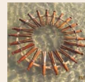
Corinne Colbert- Floating Wreath