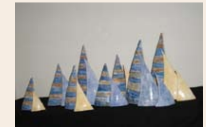
Di Buckland- Broadwater Fleet