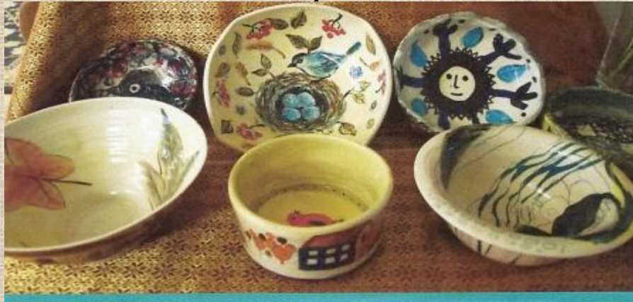
Photo below by Suki Mead shows some bowls decorated at last year's Empty Bowls charity event.

These workshops are in preparation for the Potters EMPTY BOWLS FUNDRAISING LUNCH Sunday 19th June - Gold Coast Potters replacing hunger with hope - raising money for the homeless and needy.