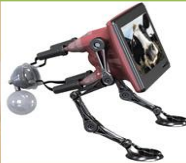
2010 SPECIAL COMMENDATION Jason Christopher, Milk Machine