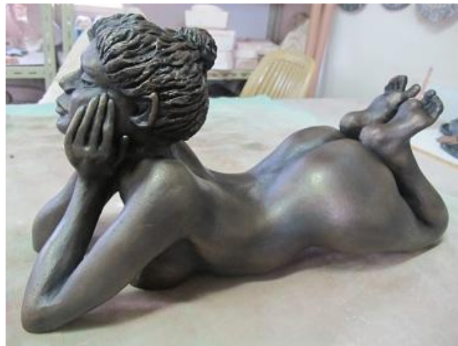
Alison Spalding - "Jessica" - clay