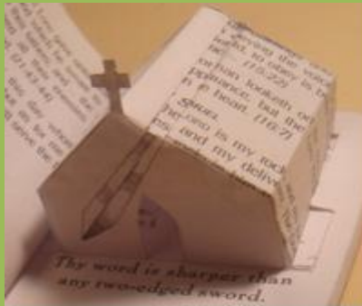
2010 WOOLLAHRA SMALL SCULPTURE PRIZE Archie Moore, Humpy Goona