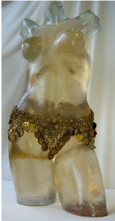
Midge Johansen - "Belly Dancer" clear cast polyester