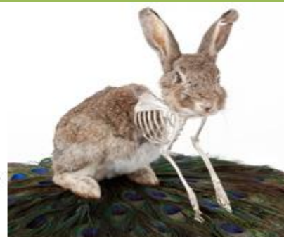
2010 VIEWERS' CHOICE Julia deVile, Ego Verto