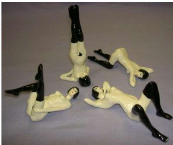
Midge Johansen - "Yoga" ceramic miniature sculptures